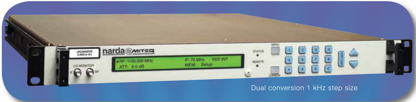
Dual conversion 1 kHz step size