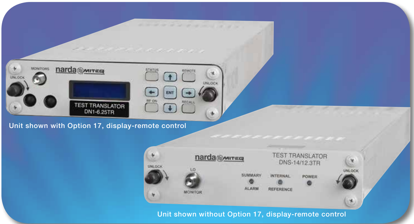
Unit shown with Option 17, display-remote control