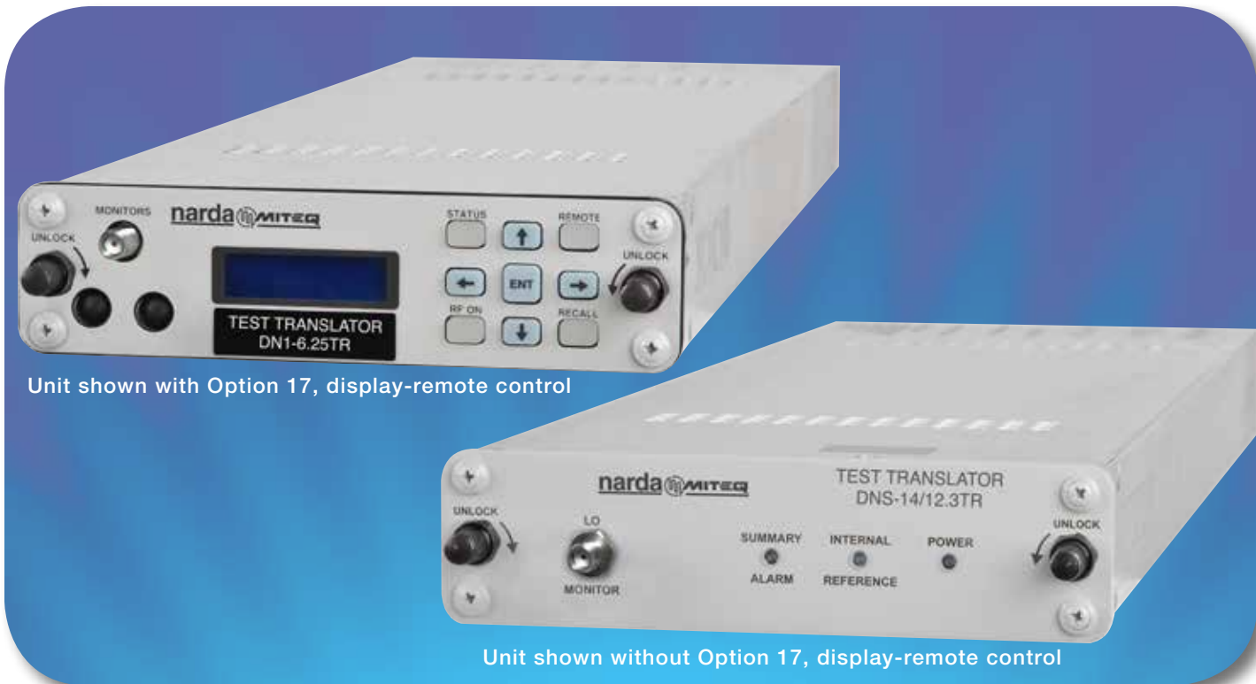
Unit shown with Option 17, display-remote control